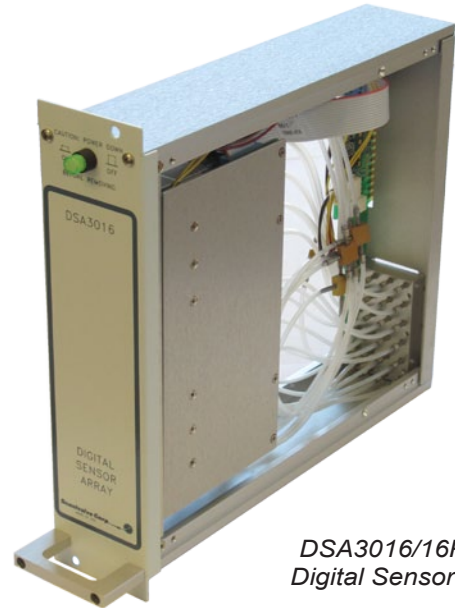
DSA3016/16Px-RA Digital Sensor Array

The DSP processor also controls the actuation of an