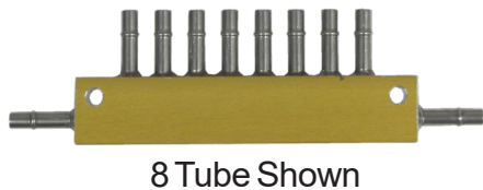
8 Tube Shown