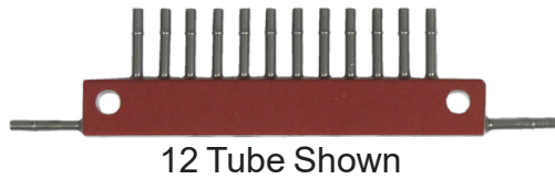
12 Tube Shown