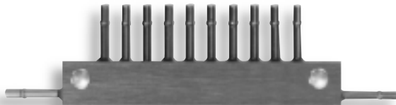
10 tube shown