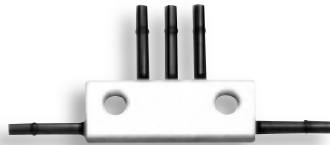
3 tube shown