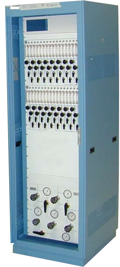
A typical DSA3218 continuous purge system for Steam Turbine performance testing.

Model DSA3218 intelligent pressure modules communicate through industry proven Ethernet TCP/IP. Data is output in Engineering Units (EU). A system may be monitored from any PC or plant network connection using Telnet, Hyperterminal, LabView, or an OPC server.